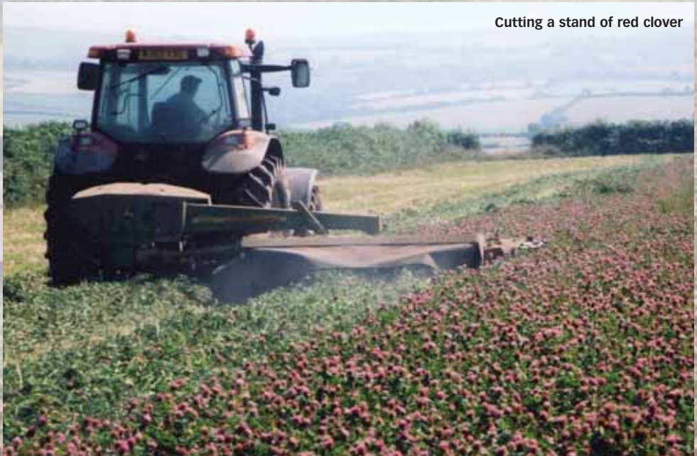
Cutting a stand of red clover

and varieties. Our technical staff have already undertaken this fundamental work so you can be sure that whether you require a grass/white clover ley for grazing or a highly productive grass/red clover ley for silage the performance-proven mixture you need is available now.