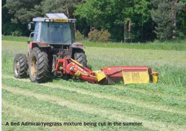
A Red Admiral/ryegrass mixture being cut in the summer.

Apart from the 'free' nitrogen (a contribution of up to 250 kg N/ha/year) there is the fact that research has shown that the